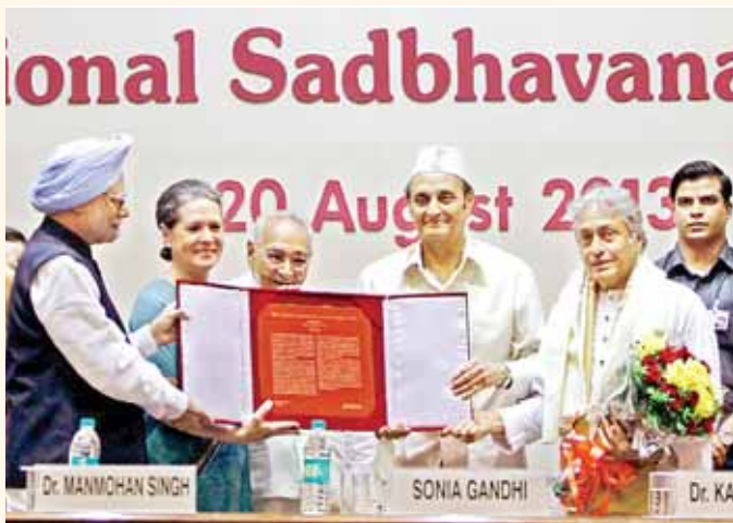
Ustad Amjad Ali Khan receiving Rajiv Gandhi National Sadhbhavana Award from Prime Minister Manmohan Singh. Also seen in the picture UPA Chairperson Sonia Gandhi

Conferring sardar maestro Amjad Ali Khan with the Rajiv Gandhi National Sadhbhavana Award for his contribution in promoting communal harmony and peace, PM Manmohan Singh emphasised on the fact that music has a universal appeal and speaks one language.